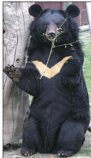
Animals Asia Moon Bear Rescue