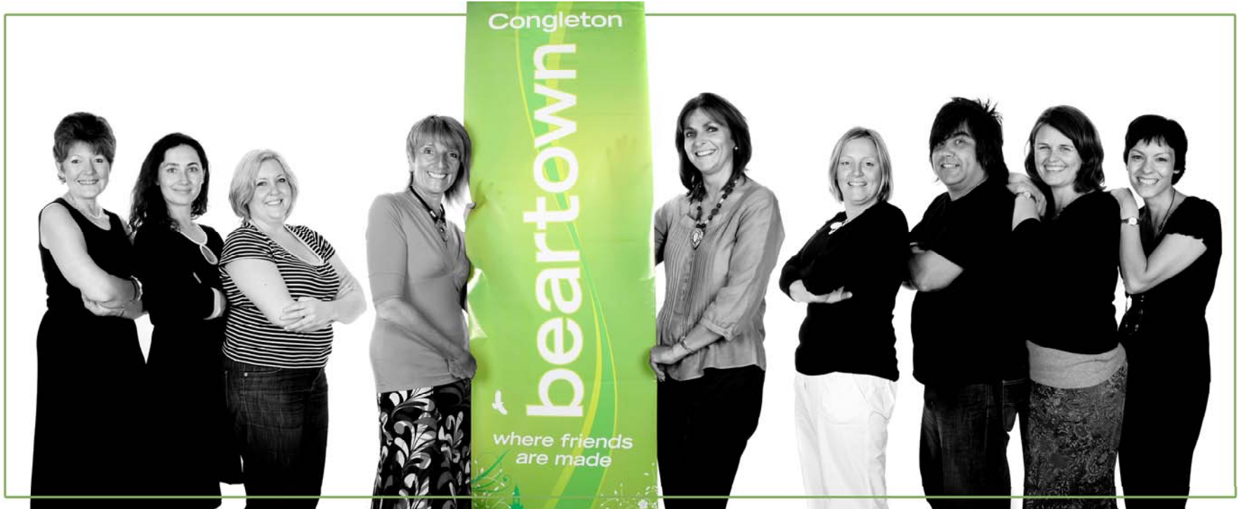
The BEAR TEAM - Enriching Awakening Reviving Congleton